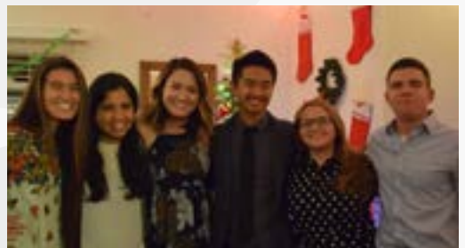
MEMBERS OF ST. JOSEPH HOUSE AT NEWMAN'S CHRISTMAS PARTY