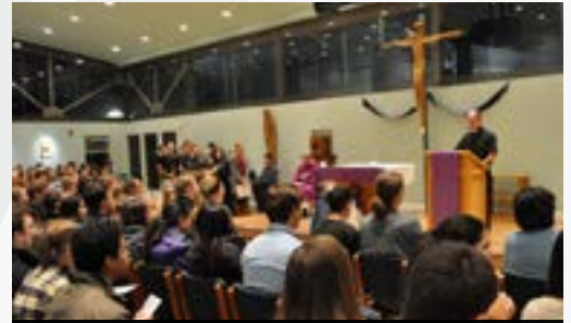
SUNDAY MASS IN OUR LADY OF MERCY CHAPEL

See the reverse side for the registration form. We hope to see you there on May 6th!