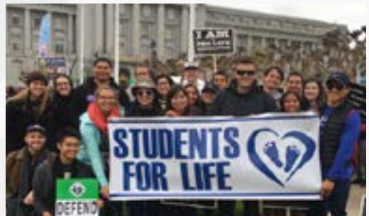
MEMBERS OF NEWMAN AT THE WALK FOR LIFE