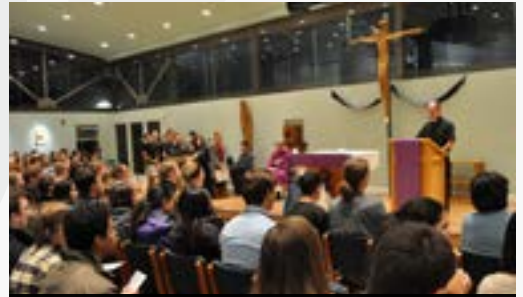
SUNDAY MASS IN OUR LADY OF MERCY CHAPEL

See the reverse side for the registration form. We hope to see you there on May 6th!