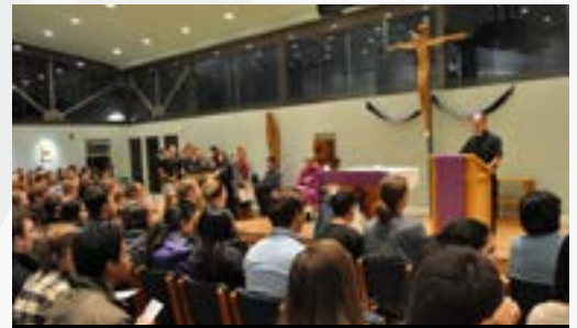
SUNDAY MASS IN OUR LADY OF MERCY CHAPEL

See the reverse side for the registration form. We hope to see you there on May 6th!