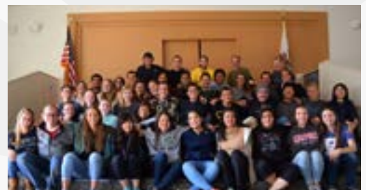
FALL RETREAT HOSTED BY FAITH HOUSE